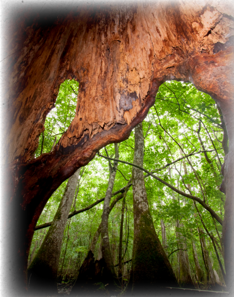
View from inside a hollow cypress tree

The Eastern Big-eared Bat, a species being considered for endangered status, is especially fond of the old-growth portions of the Beidler Forest. One reason Big-eared Bat numbers are so low may be their preference for roosting in hollowed out trees near water. This means a swamp provides an ideal habitat for these animals. Most swamps, however, have been logged and few trees are allowed to get old enough to hollow out. The Beidler Forest, with its great number of ancient cavity trees like this one, may be the "last best place" for the Big-eared Bat.