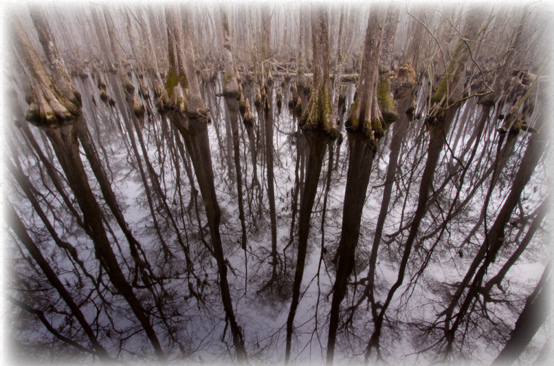
Tupelo gum and bald cypress trees

It just won't do to call every wet place a swamp!