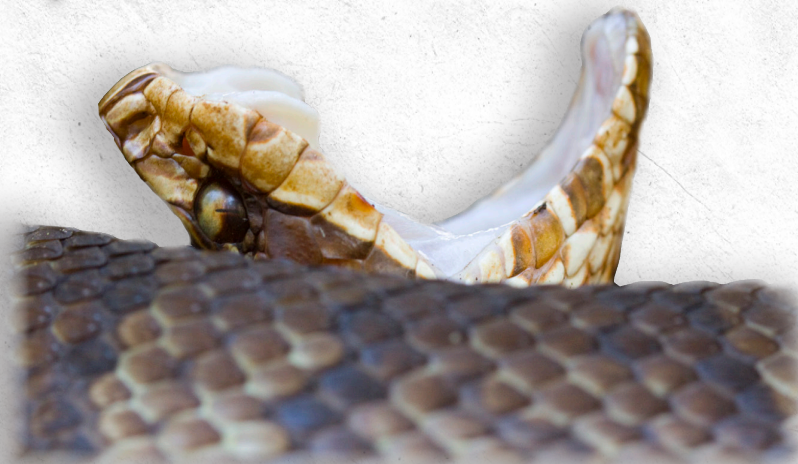
Cottonmouth (Water Moccasin)