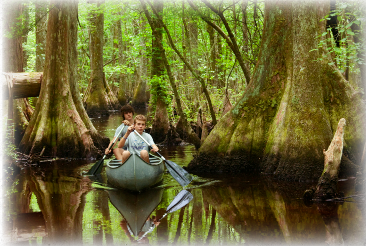
Paddling along the canoe trail

While the boardwalk proves a wonderful way to see the swamp, it is not the only way. Beidler Forest offers a variety of activities and events scheduled year-round including: