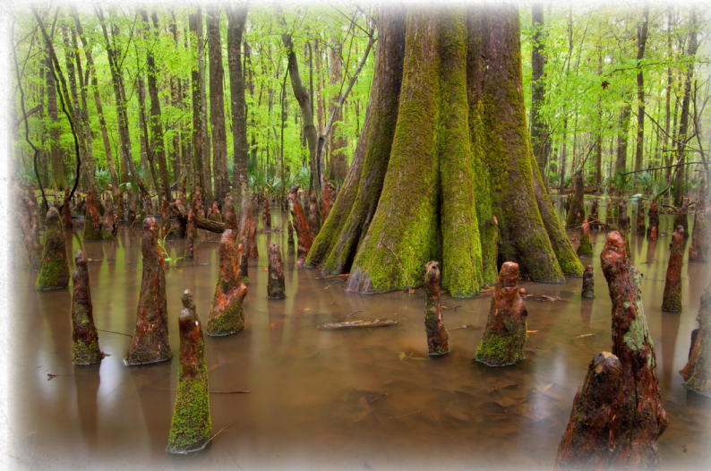
Knees help to anchor the bald cypress during high winds

On the night of September 21, 1989, Hurricane Hugo slammed into the South Carolina coast, packing winds of up to 150 miles per hour. Hugo continued inland with the eye of the storm passing over Beidler Forest early on the 22nd. Much of the damage has now rotted and new, young trees are busy replacing the losses. This huge cypress toppled during the hurricane, taking the boardwalk with it.