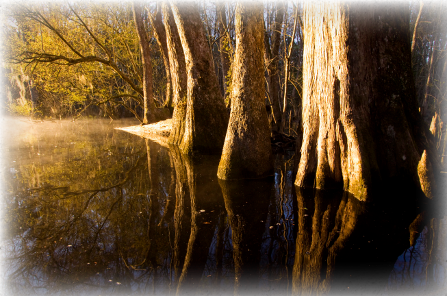
Cypress and tupelo gum on Mallard's Lake

These changes in elevation may appear insignificant, but because of how they affect water depth and the duration of flooding, they make a big difference to the location of plant communities.