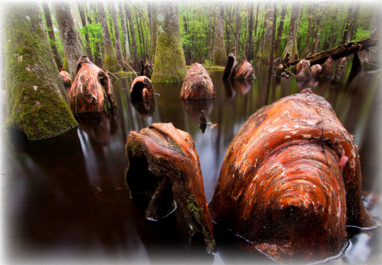
Cypress knees and blackwater along the "Swamp Stomp"

Swamp water levels vary dramatically (as much as 5 feet per year) because the majority of the flow comes from rainfall. This can result in an 18-inch rise in one or two days after an upstream downpour, or a drop of 2 inches per day during a drought. The ONLY thing constant about the water levels in the swamp is that they are always changing!