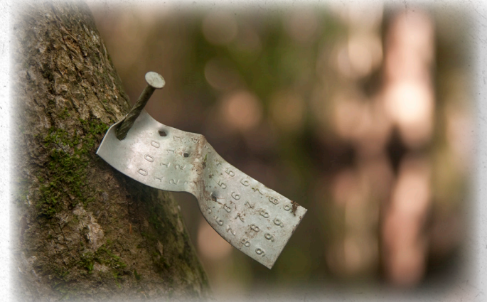
Hugo recovery research tag

The ribbons, stakes, and metal tags visible here mark the location of a Hurricane Hugo research plot. We have recorded information for every tree found on 16 plots located throughout the sanctuary. We have learned how the forest was changed by the storm, and over time, we'll be monitoring its recovery.