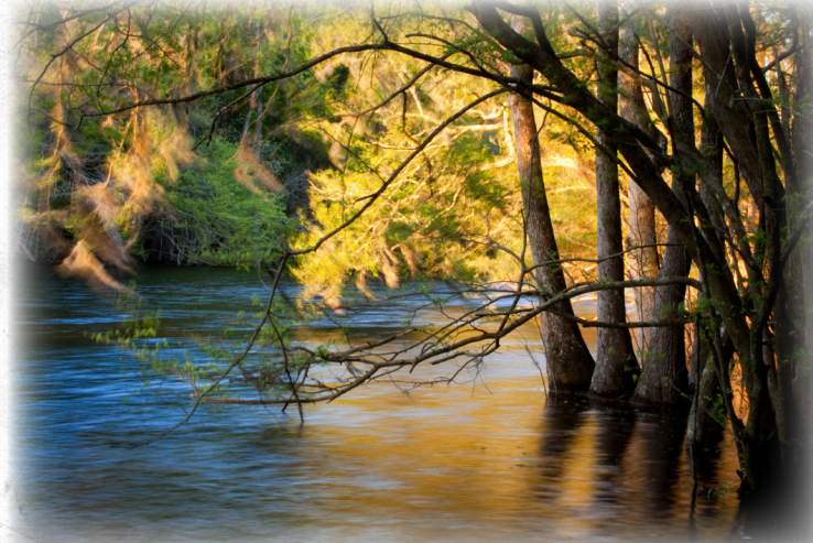
Tupelo Gum at Mallard's Lake

Four Holes Swamp is approximately 60 miles long, originating near St. Matthews, SC and emptying into the Edisto River just upstream from Givhan's Ferry State Park. The swamp encompasses roughly 40,000 acres, but drains nearly 430,000.