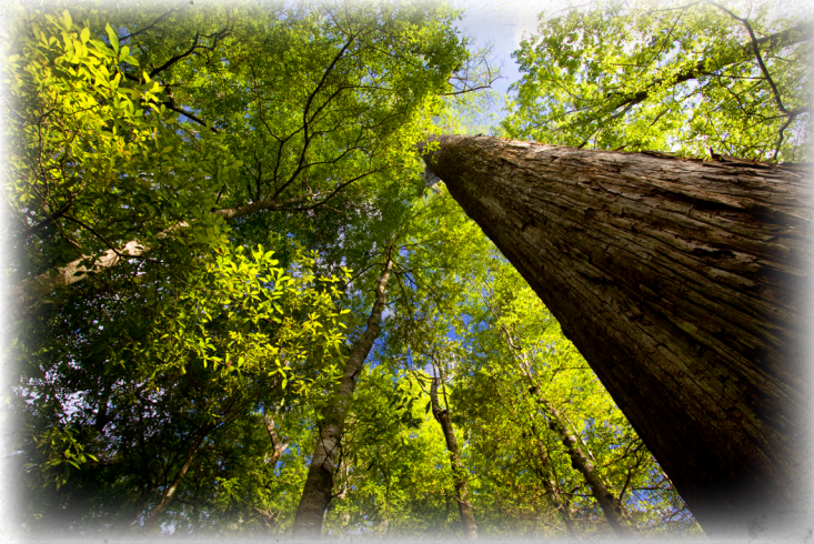
Canopy over the boardwalk

There is no official consensus on how old a forest must be before it can be called "old growth," but it takes several hundred years for a swamp forest like this one to regain its old-growth characteristics and values after a clear cut.