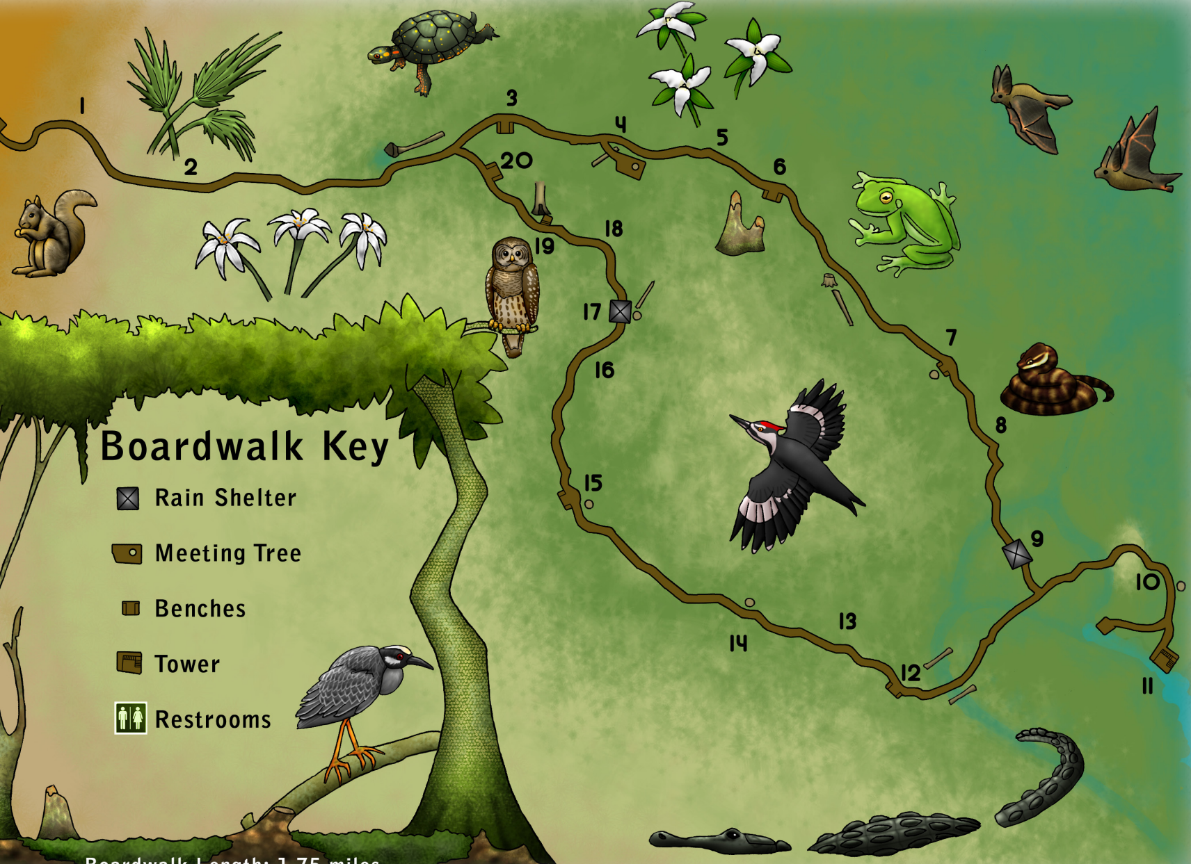
Illustration by Ricky Covey